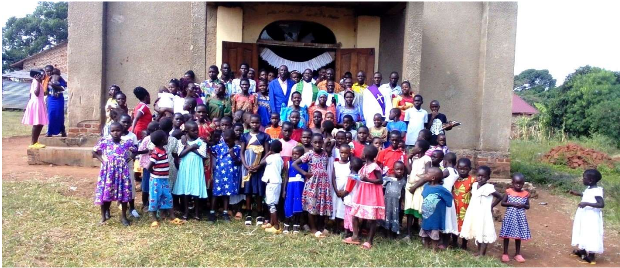
Naigobya Lutheran Church

LCU in Eastern Deanery is grateful for the support given by Lutheran Lay Renewal to the community of Naigobya to acquire more land on which the school can be expanded. We have added more two acres and there are more opportunities for expansion. The school of Naigobya is happy for receiving desks which will enable students to sit comfortably in class and ease writing. The Health Center is greatly helping the communities around it. Many walk long distances to come to our facility for medication. The only challenge now is the lack of a maternity ward to help the pregnant mothers. The community committed herself to provide all the bricks needed to complete the maternity ward once support is available and that will be their contribution.