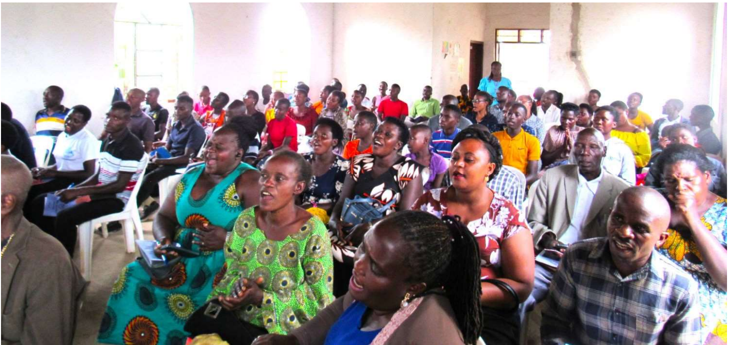
Clergy and lay leaders from all over the Southwestern Deanery attended the conference