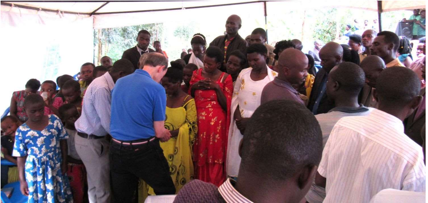
Our Executive Director and a team of seminarians and evangelists pray for the needs of those who attended the conference