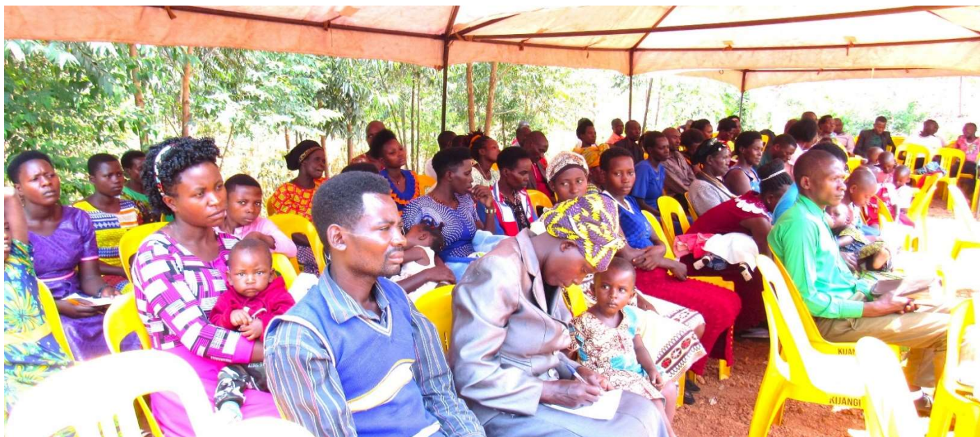
Participants sit under the tents provided by Prime Minister Mrs. Robinah Nabbanja

January 27-29 a 3-day Renewal Conference was held at Rusolera Lutheran Church, Kakumiro District, for the six Lutheran congregations in this district. Rusolera congregation has its own land but not the funds to build a church, so the event was held on the church property under tents, which were donated by Mrs. Robinah Nabbanja, Prime Minister of Uganda, who is a native of Kakumiro District. Prime Minister Nabbanja also sent her greetings to all the attendees through two district government leaders, who also spoke to the gathering.