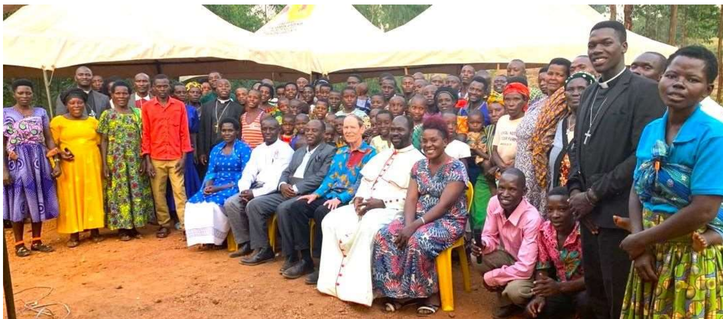
Group photo at the close of the conference

"The participants were from different congregation of the Lutheran Church of Uganda and other community members within Kakumiro, Kikuube, Hoima, and Masindi Districts. Other participants were drawn from other religious denominations: Anglican, Roman Catholic and Pentecostal churches. In total, the training was attended to by 77 people, both males