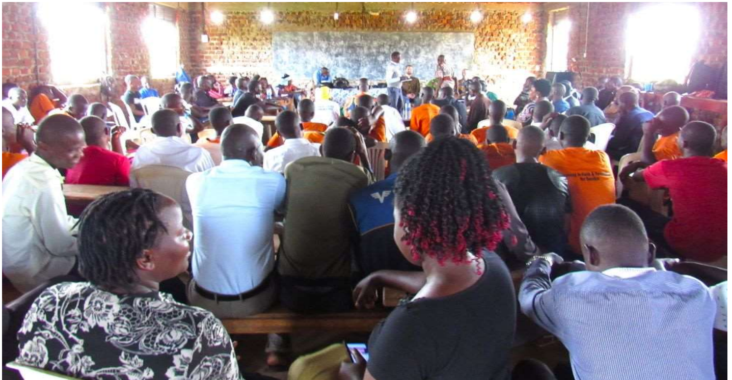
Renewal Conference at Our Savior Lutheran Secondary School

In the Eastern Deanery, our Executive Director spent two days visiting many congregations in the deanery, as well as the Naigobya Health Clinic which we have been supporting financially for six years. In addition, he led another 3-day Renewal Conference for church leaders in the deanery. This conference was held at Our Savior Lutheran Secondary School, Magamaga, and also included dozens of students from the school.